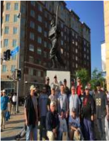
The group in front of PNC Stadium before the game.

Operation Welcome Home would like to extend a heartfelt “Thank you” to the Fraternal Order of the Elks for their indispensable help in providing transportation for our annual trip to see the Pirates play in Pittsburgh. We’d also like to thank the Clarksburg VA for bringing their inpatient crew along with us again this year.